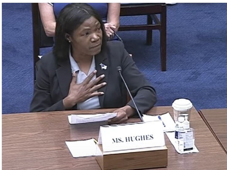
Watch the video by clicking here or on the image above